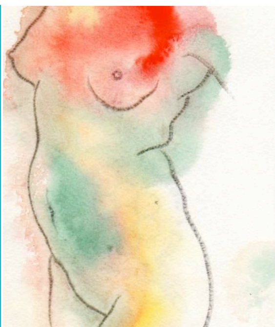
Figure 1: Lars Kraemmer: 'Celestine' (Front and back images)

From ongoing research with artmoney artists, I have sought to understand the different uses and meanings of artmoney for its various producers. Who are these people and why are they involved in artmoney production? What rewards do they obtain from it? How are they using artmoney in practical and everyday terms? And, more broadly, what do the different uses and users of artmoney tell us