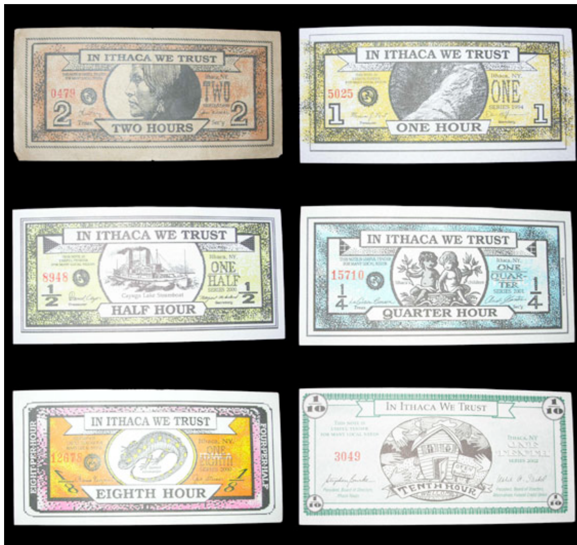
Figure 2. Denominations of Ithaca Hours